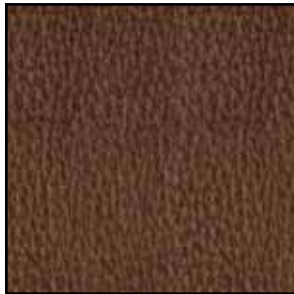
Dulce de Leche